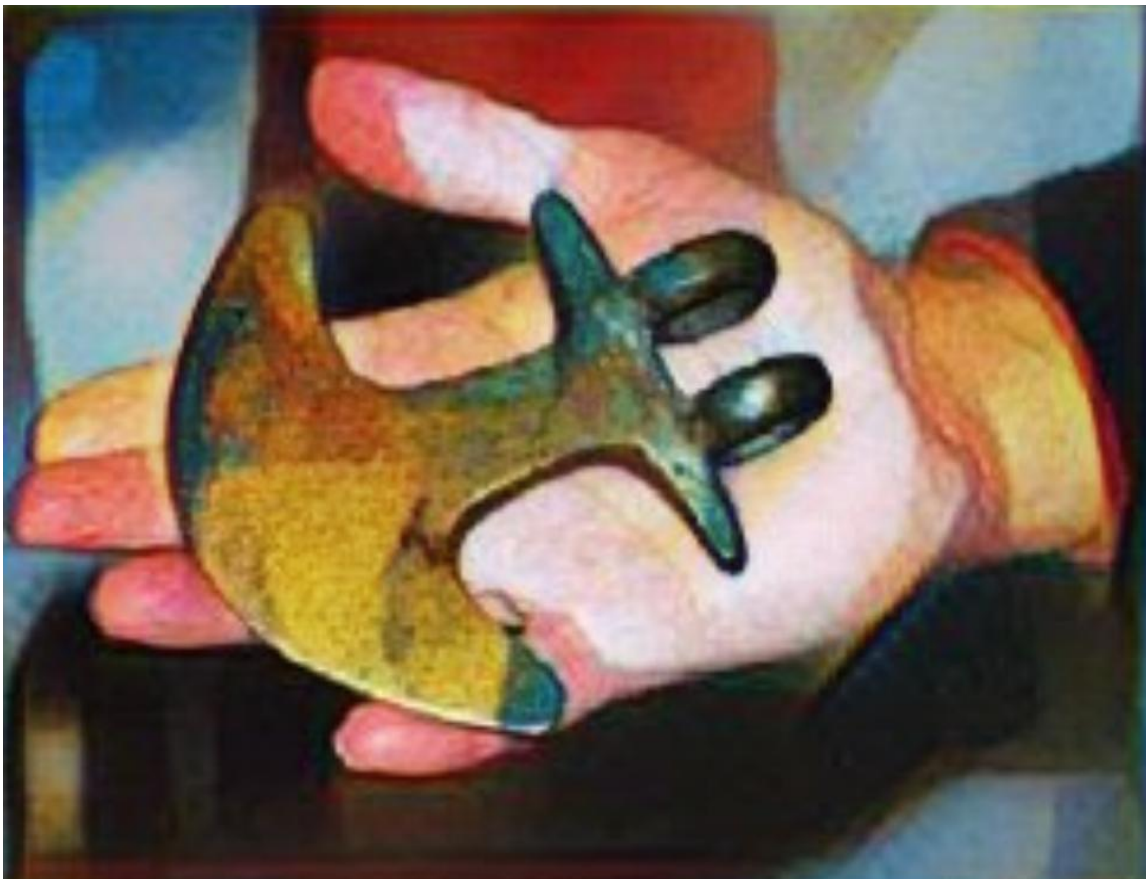
Orichalcum from ancient atlantis

An asteroid was only 186,000 miles away at that time?; and, in february of that year it did nearly become captured by earth's gravetic pull; and, would have as stated if it had been just a little slower in its speed; stay, tuned for some more information about atlantis; and, if you'd like to learn more you can go to blog talk radio for interviews about such a time;